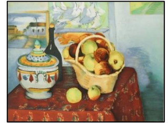
Still Life with Apples by Paul Cézanne

In this collection of lessons, the children will learn and develop their skills in: design, drawing, craft, painting and art appreciation; creating an optical illusion print, replicating a plate in the famous willow pattern, carving sculptures out of soap, drawing a collection of still life objects, painting and mixing colours like Paul Cézanne and learning about the role of a 'curator'.