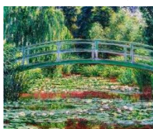
The Japanese Footbridge

In Art this term, Year 6 will be practice blending paints to create their own impressionist-style watercolour, based on 'The Japanese Footbridge' by Claude Monet. We will also be looking at the repeating patterns of zentagles and will attempt to create our own zentangles using print techniques.