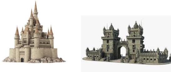
Images of castles that will inspire our designs

In Design and technology this half term, we will investigate castles designs, constructing 3D shapes and designing castles for a particular purpose. We will then use a variety of 3D shapes and junk material to construct our designs. Finally, we will assess our finished pieces.