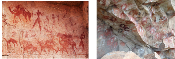
Images from 'Cueva de las Manos'

In art this term, year 3 will be developing their drawing skills which we will then use to allow them to investigate different mediums to help them create a cave painting.